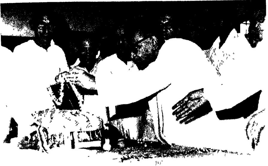
Placing a wreath on the Kalpa Sutra